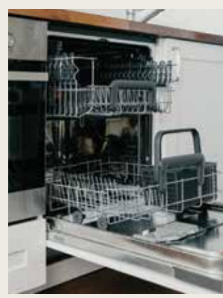
Discounts on new appliances