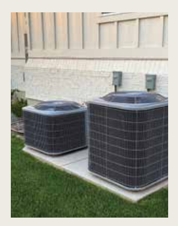
Seller HVAC Option