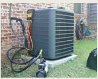
Pre-season HVAC tune ups