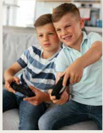
Electronics Protection Plan