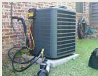
Pre-season HVAC tune ups