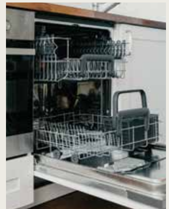
Discounts on new appliances