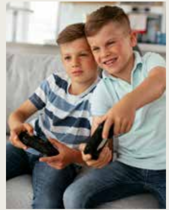
Electronics Protection Plan