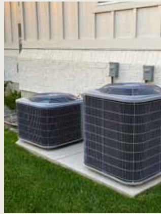
Seller HVAC Option